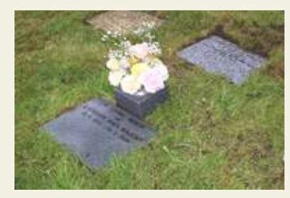
Cremation Tablets in a Churchyard

We have our own Memorial Masonry Department and if desired we will be pleased to discuss your requirements subject to any cemetery or churchyard regulations. Please contact the office if you would like to receive our memorial brochure.