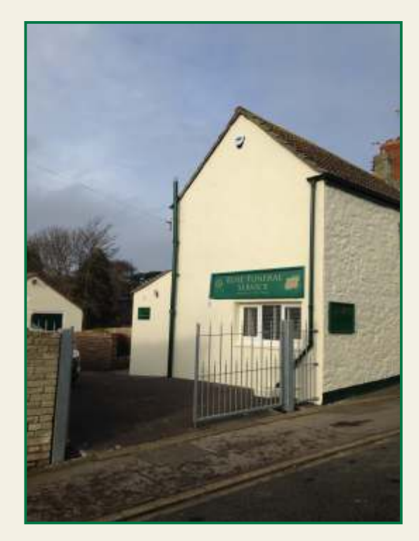
Premises in Shrubbery Lane, Wyke Regis